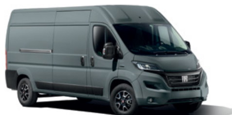
LANZAROTE GREY (OPTION)