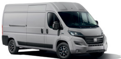
CAMPOVOLO GREY (OPTION)